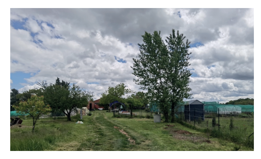
M. Spagnol previously collaborated with colleagues at the CODC, CNRS, and ADNid to develop a standardised naming convention and establish a genetic architecture of self-incompatibility in olives.

The DNA analyses mentioned above are required to correctly identify and barcode their groups and haplotypes. This allows the selection of the highest potential pollen-productive combinations so their pruning can be staggered over several seasons to give the best chance of continuous harvest. Once the branches have at least doubled in number of buds, the plants must be monitored closely to observe the optimal amount of sap and vessels to move on to the next stage. Moving to the nursery, these cultivars are then cloned to ensure the heritage of these endemic pollinators is safeguarded and preserved. The success rate for seedling production in the nursery has already increased from 50 – 90%.