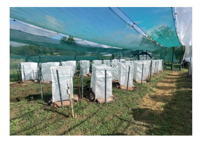
M. Spagnol and his colleagues are using the PBS International Midi tents to perform phytosociological testing in total confinement during the olive plants' two-month potential flowering period.

To do this, the plants are in market garden greenhouses and separated into groups of four plants per PBS tent. This includes all varieties to maximise the combinations available in a single (two year) fruit-bearing cycle.